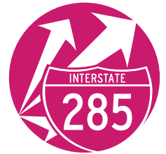
I-285 Advanced Improvement Projects