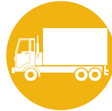
Commercial Vehicle Lanes Project