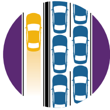
5 Major Express Lanes Projects