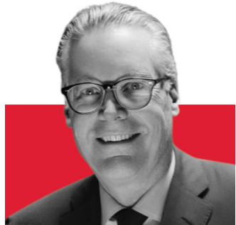
Ed Bastian, CEO Delta Air Lines MAC Chair-Elect 2021